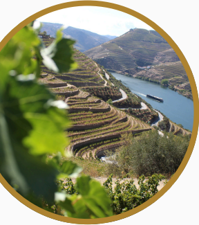
Douro River Cruise