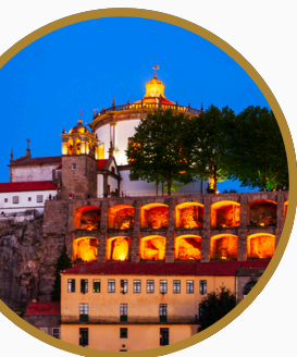
Monastery of Serra do Pilar (Vila Nova de Gaia)

A picturesque neighborhood where the Douro River meets the Atlantic Ocean. It's a lovely spot for a relaxing beach day, and you can walk along the beach promenade, enjoy the ocean views, and visit charming cafés and bars by the shore.