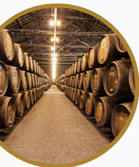
Wine Cellars (Vila Nova de Gaia)