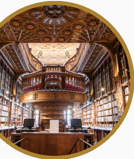
Livraria Lello (Porto)

One of the most beautiful bookstores in the world, with its stunning neo-Gothic interior and winding staircase. A must-see for book lovers and architecture enthusiasts. Booking highly recommended.