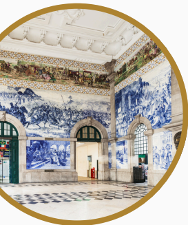
Sao Bento Train Station (Porto)

A magnificent 19th-century building, known for its stunning neoclassical architecture and the ornate Arab Room. Guided tours provide insights into its history.