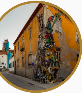
Street Art Tour (Porto)

This iconic bridge connects Porto to Vila Nova de Gaia. It's a great way to walk between the two cities and get fantastic views of Porto's riverside.