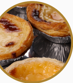
Pastéis de Nata

For a truly indulgent treat, try the Baba de Camelo , a dessert made from sweetened condensed milk, eggs, and caramel – a perfect way to end your meal.