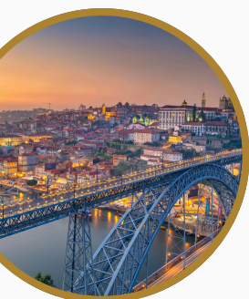
Miradouro da Serra do Pilar (Vila Nova de Gaia)

One of the best spots for a sunset view. Situated across the river from Porto, it offers a breathtaking panoramic view of the Porto skyline with the iconic Dom Luís I Bridge in the foreground.