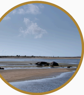
Douro Estuary Nature Reserve (Vila Nova de Gaia)

Head to the mouth of the Douro River, where it meets the Atlantic Ocean. It's a lovely spot for a walk along the beach or to enjoy a drink at one of the trendy seaside bars.